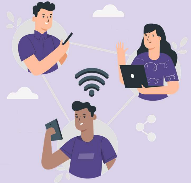
An internet connection