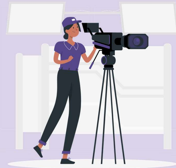
A smartphone or camera